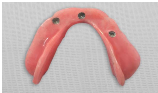
Figure 6: Mandibular denture with ball matrices (group III).