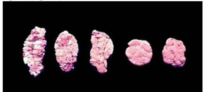
Figure 4: Gum samples after different chewing strokes.

The samples have been spat into transparent plastic bags. These bags were labeled with the corresponding numbers of strokes. To diminish the effect of fatigue, an interval of at least 1 minute was imposed between the different tests. The overall duration of the experiment was almost 8 minutes. Unmixed fraction (UF) was computed (Figure 4).