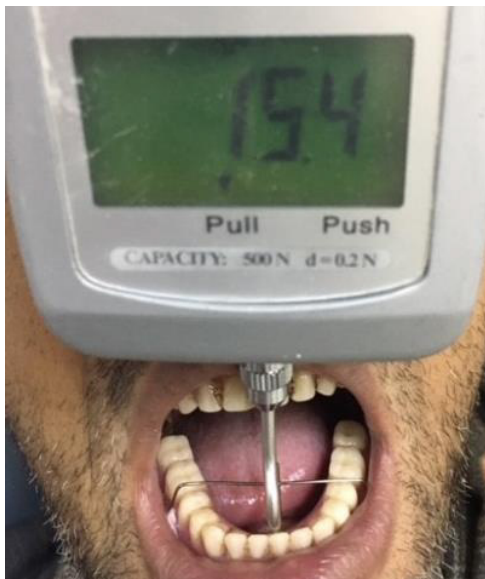
Figure 3: Forcemeter connected to the wire at the midpoint.

Retention measures were taken at time of insertion (T0), and after one month (T1) thereafter.