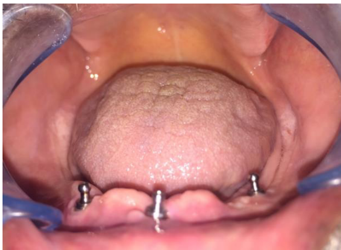
Figure 5: Three ball abutments in place (group III).