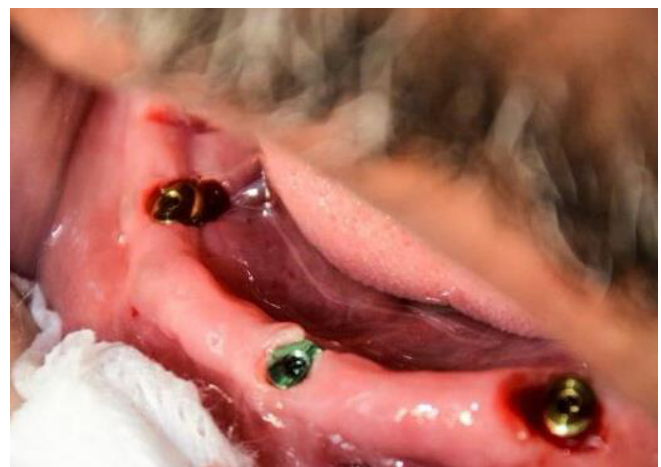
Figure 2: Three implants in the receptor sites.

Three implants of 3.8 mm diameter, 12 mm length (Biohorizons Tapered Implant) were surgically installed in the midline and 1st premolar areas using flapless surgical approach. Relining was carried out for the denture with a tissue conditioner material (Ufogel; Voco, Cuxhaven, Germany) (Figure 2).