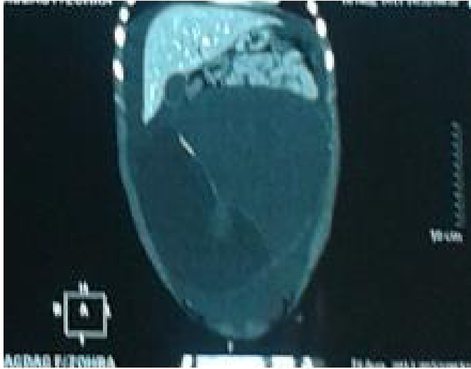
Figure 2: CT (coronal view) of the abdomen and pelvis showing cystic mass and hemoperitoneum.

Because of the clinical findings and 1 gr/dl hemoglobin fall in three hours, an immediate exploratory laparotomy was performed.