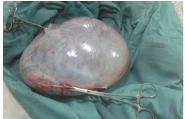
Figure 4: Laparotomy specimen showing right ovarian cystic mass.

Postoperative recovery was uneventful and at follow up one year after surgery the patient was completely asymptomatic. Histology confirmed the diagnosis of ovarian juvenile granulosa cells cystic, evaluated as granulosa cell tumor at least stage 1, no chemotherapy was given.