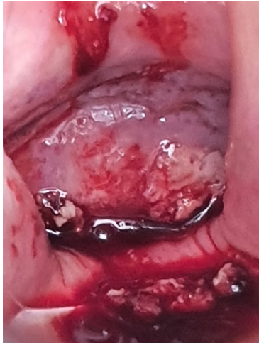
Figure 1: Ulcerate, budding and bleeding on contact cervical cancer.

The most represented histological type was squamous cell carcinoma in 95% of cases and adenocarcinoma was represented by two cases (3%) and 1 cases of sarcoma (2%) (Figure 2). The stage of extension most represented was locoregional stage in 70% of cases followed respectively by the local stage and metastatic stage in 16% of cases and in 14% of cases (Table 3). To the patients that received treatment (47%), the most represented treatment was chemotherapy in 56% of cases followed by radiochemotherapy in 37% of cases, followed by the association of radiotherapy+chemotherapie+surgery in 7% of cases. No patients received surgery or radiotherapy alone (Table 4).