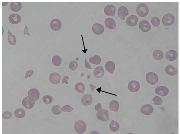
Figure 2: Blood smear from peripheral blood smear with clear presence of schistocytes.

Preeclampsia is a disorder associated with gestational age longer than 20 weeks, with blood pressure higher than 140/90 mm Hg, dipstick with 1+ protein in urine sample. The diagnosis could be settled when gestational arterial hypertension, nausea or vomit, in addition to thrombocytopenia presence with alterations in liver enzymes 1 . It was found proteinuria, diastolic and systolic blood pressure with a significant rise in both groups, predominantly in the primiparous patient.