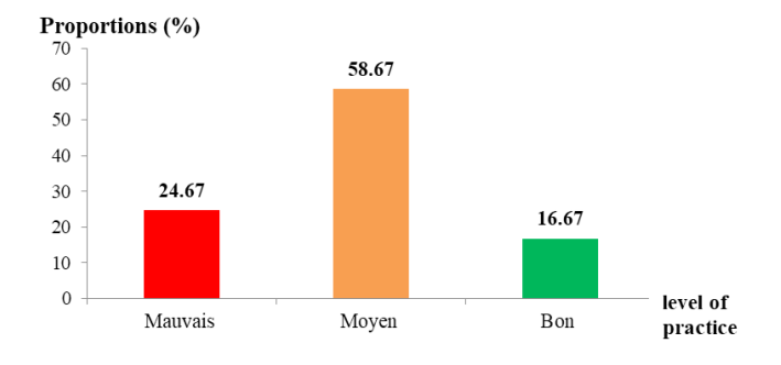
Figure 2: Distribution of subjects according to level of practice. N = 150 (Multicenter study, Parakou 2019).

In our study, 88 patients had an average level of practice, i.e. a proportion of 58.67% as shown in Figure 2. Practice was considered good for a score between 04 and 05 points; average for 02 to 03 points then bad between 00 and 01 point.